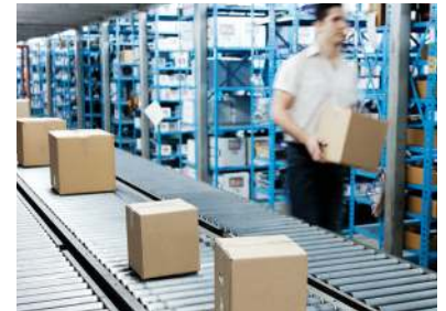
Manual Postal sorting