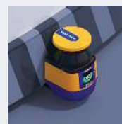
Safety Laser Scanner