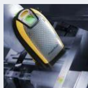
Hand Held scanners