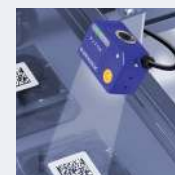
Stationary Industrial Scanners