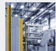
Safety Light Curtains