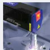
Laser Marking Systems